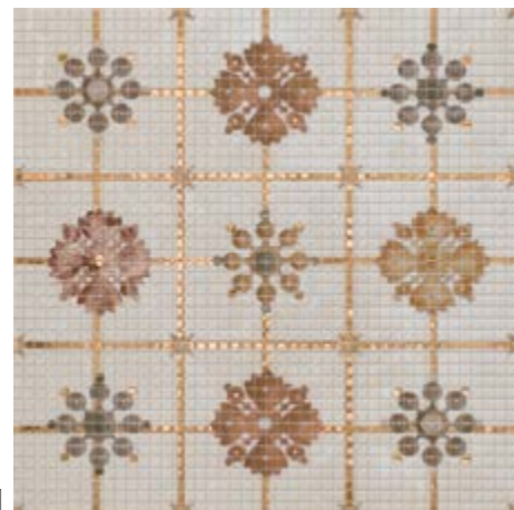
13881 D. ASTON-M/60/P P-76 (60x60)