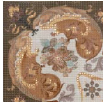
13674 E.D. ASTON-M/44/P P-87 (44x44)