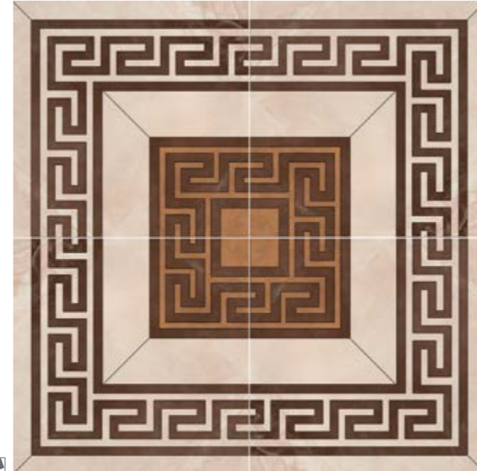
*11610 ROS. GINGER/88/P P-83 (88x88)

COMPUESTO POR: AGATHA-C/44/P AGATHA-M/44/P AGATHA-H/44/P