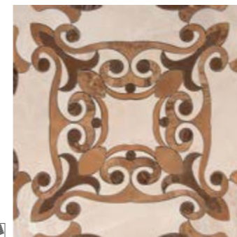
11589 D. FONTAINE/44/P P-96 (44x44)