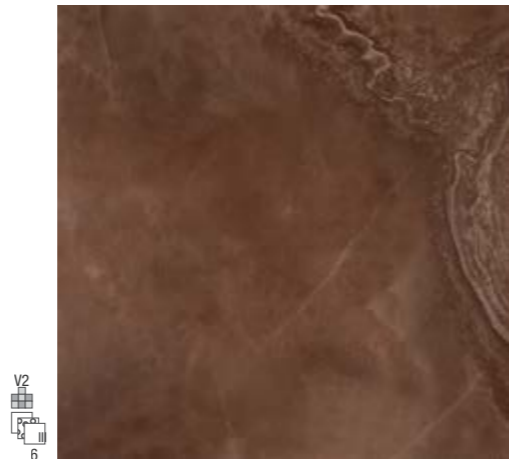
11921 AGATHA-M/60/P M-37 (60x60)