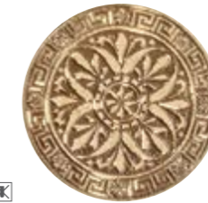
08143 T.I. SOFIA/P P-70 (29x29)