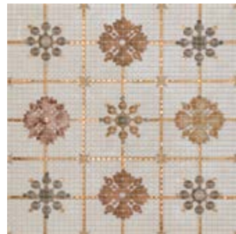
13676 D. ASTON-M/44/P P-87 (44x44)