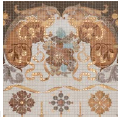
13882 L.D. ASTON-M/60/P P-76 (60x60)