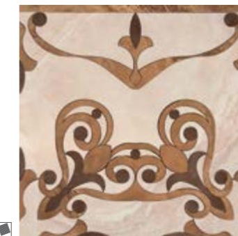
11591 L.D. FONTAINE/44/P P-90 (44x44)