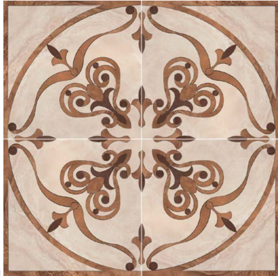
*11955 ROS. FONTAINE/120/P P-98 (120x120)

COMPUESTO POR: AGATHA-C/60/P AGATHA-M/60/P AGATHA-H/60/P