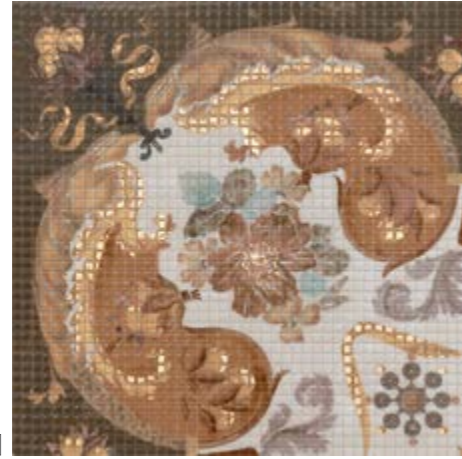
13883 E.D. ASTON-M/60/P P-76 (60x60)