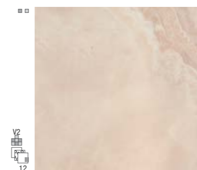
11320 AGATHA-H/44/P M-30 (44x44)