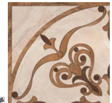
11590 E.D. FONTAINE/44/P P-90 (44x44)