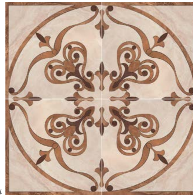
*11609 ROS. FONTAINE/88/P P-84 (88x88)

COMPUESTO POR: AGATHA-C/60/P AGATHA-M/60/P AGATHA-H/60/P